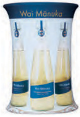
Pop up desk